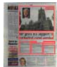
VENUE: Ely Cathedral, which will host the Festival of Carols concert on December 10. Inset, South Cambridgeshire MP Andrew Lansley